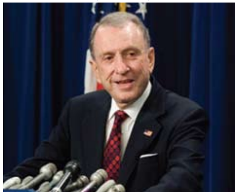
Sen. Arlen Specter (R-PA) led efforts for $10B NIH increase. On March 24, Research!America recognized him with its Legacy Award .

NEI has announced that it anticipates receiving $175 million over the next two years from the $10.4 billion NIH funding within the American Recovery and Reinvestment Act (ARRA, PL.111-5), signed by President Obama on February 17. In addition to those two-year stimulative dollars, the FY2009 Omnibus Appropriations Act (PL 111-8), signed by President Obama on March 11, increases NEI funding by $21.4 million to a level of $688.5 million (see funding chart). Although that 3.2 percent increase in annual appropriations is the largest since FY2004, it just barely matches the