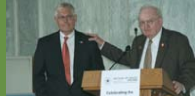
Original lead H. Res. 366 co-sponsor Cong. Pete Sessions (R-TX) (left) welcomed fellow co-sponsor Cong. Howard Coble (R-NC) to the reception