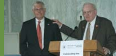
Original lead H. Res. 366 co-sponsor Cong. Pete Sessions (R-TX) (left) welcomed fellow co-sponsor Cong. Howard Coble (R-NC) to the reception