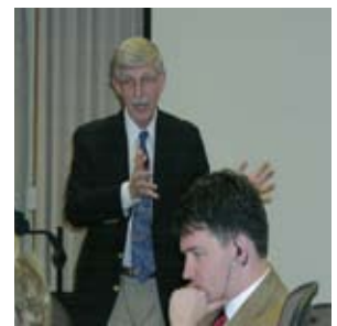
NIH Director Dr. Collins speaks to the SMRB

Late on the second day, NIH Director Dr. Collins requested that the SMRB