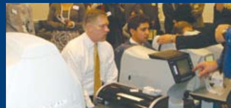
Foreground: Cong. Sessions participates in the screening