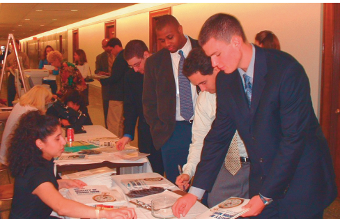
Congressional staff registering for the AEVR Briefing