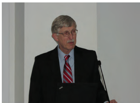
NIH Director Francis Collins, M.D., Ph.D. speaks to the SMRB

On October 26, the NIH's Scientific Management Review Board (SMRB) held its tenth meeting to review the status of its recommendations on structure and management issues, which is its mission, as enacted in the NIH Reform Act of 2006 .