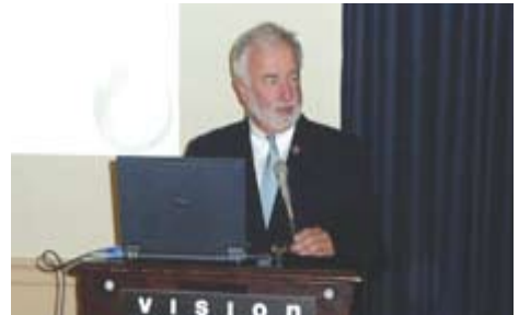
Cong. Tim Bishop (D-NY) spoke about the event sponsors' dedication to blindness prevention