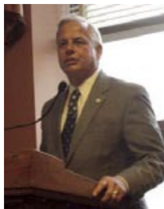
Vision Caucus co-chair Cong. Gene Green (D-TX)