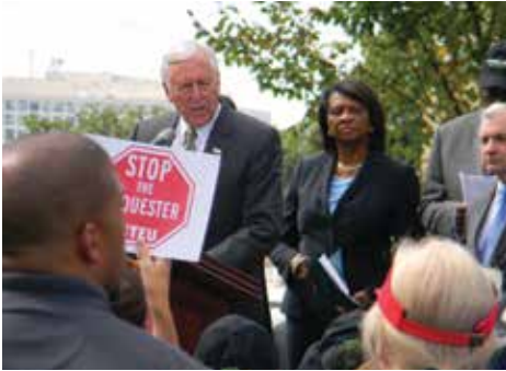
House Minority Whip Steny Hoyer (D-MD) addresses the crowd at the “Raise the Caps” rally hosted by the Nondefense Discretionary (NDD) United coalition which the EVS contingent observed

“RPB cares deeply about robust, sustained, and predictable funding for NIH and NEI, and we have a long history of supporting emerging vision scientists who go on to contribute strongly to the fight against blinding disorders. I was heartened to have so many join us in expressing these concerns to our nation’s policy makers. AEVR’s and NAEVR’s effective coordination of Capitol Hill education and Congressional delegation visits, respectively, is another example of the productive partnership that RPB has with the Alliances to encourage national leaders to address the needs of those facing vision loss”